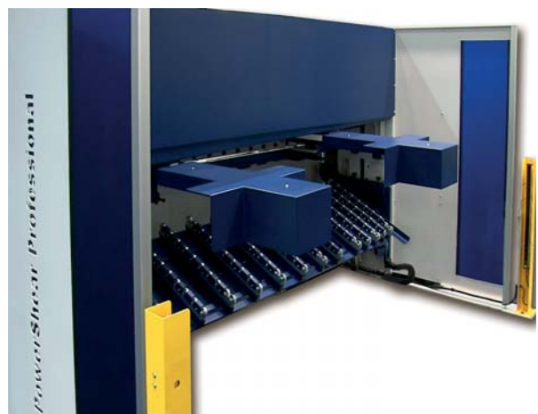
Rear view: Motorized back gauge and sheet support as well as rear light barrier

The advanced electronic control for programming cutting steps is operated via a touch display.