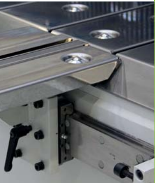
Moveable table extension on guide rail