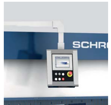
Option: touchscreen control CGS 80 on swivel arm

The 8" touch control system is mounted in the protection cover as standard. Cutting programs can be programmed quickly and with no computer skills. Optionally the software control can also be mounted on a swivel arm in order to allow more flexibility.