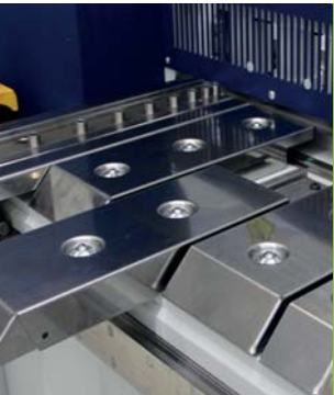
Exchangeable stainless steel plates