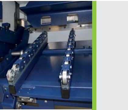
Sheet support, pneumatically controlled