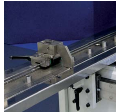
Option: Movable angle gauge on guide rail