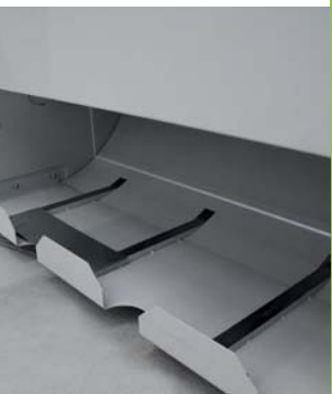
Sheet shute to the front