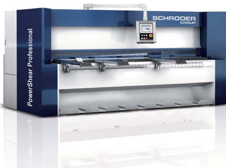
The PowerShear Professional with energy-efficient drive ensures precise, burr-free and torsion-free cuttings.

The hydraulic shear PowerShear Professional is the industrial solution in order to cut loads of big sheets at high speed. The robust and yet precise machine is ideal for continuous operation in workshops, mid-sized companies and the industry.