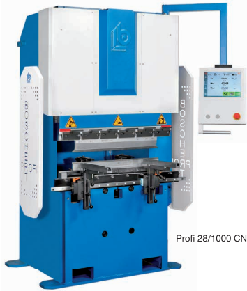
Profi 28/1000 CNC

The BOSCHERT Profi 28 NC and Profi 28 CNC are precision hydraulic press brakes. The extremely compact and robust structure of these machines and the twin guides guarantee ram repeatability of 0.02mm.