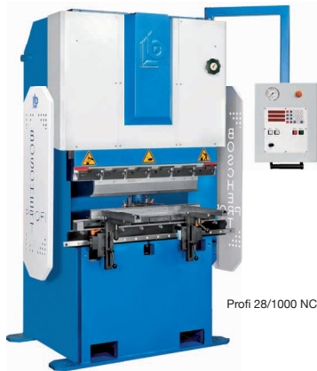
Profi 28/1000 NC