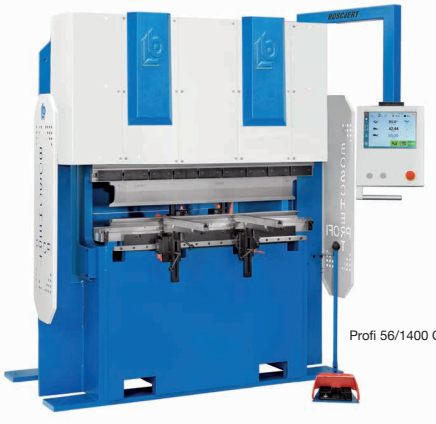
Profi 56/1400 CNC

The Profi 56 CNC models are available in 1000, 1400 and 2200mm bending lengths. The pressure of 56 tons takes place with 2 x 28 ton force cylinders. All CNC Profi 28/56 Press Brakes machines are equipped with the Cybelec CybTouch 12 as the standard control.