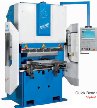
Quick Bend 28 CNC Hybrid Technologie

Productivity and ergonomics are combined in perfect harmony.