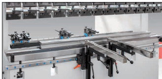
2 or optional 4 side adjustable back gauges Optional 2 adjustable front supports